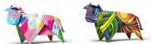
HP SmartStream Mosaic one-of-a-kind designs.