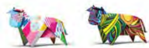
HP SmartStream Mosaic one-of-a-kind designs.